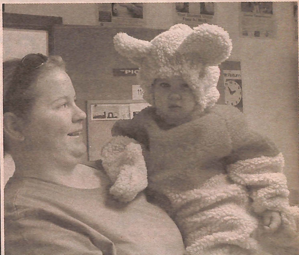
Sicaro's Favorite Baby

Attention: The Sicaro is normally the parody issue of The Picaro. Because of our non-funding we did not have the space or the resources to put out a proper spoof. In attempts to not let the Sicaro die