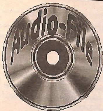
Melissa Etheridge Your Little Secret

I've always been a huge fan of Melissa's, so I was rather overjoyed when I received her new CD, Your Little Secret .