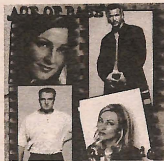
Ace of Base The Bridge

Before you groan, let me say that I too realize that A.O.B.'s first album The Sign was played to death on most of the planet. But, don't let that discourage you