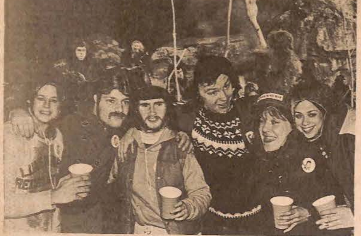
Confused identities: The MSVU liquor pigs ready to head off for the 1982 World Championships in Vancouver. Other teams from around the world will be competing in this prestigious competition.

Consult local listings in your area for times and places of the movie soon to be released in paperback with 52 full-colour pictures. Keep an eye out for Pub Crawl II, coming in the fall.