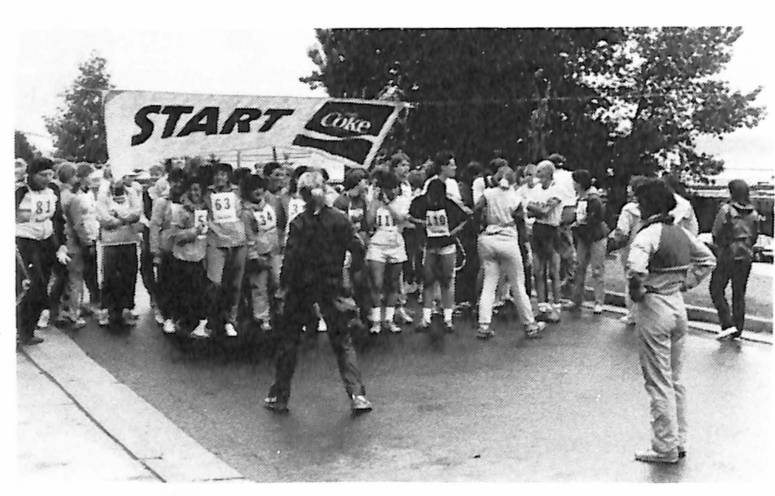
The annual Fun Run was held during Jubilee celebrations to raise money for Adsum House (a shelter for women) and the travel budget for the Athletics Department. More than $1,500 had been raised at the time of going to press, by hardy folk who turned out on a rainy, windy day to run five or ten kilometers.