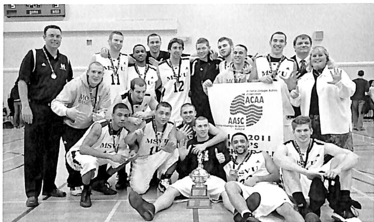
2010-2011 ACAA Men's Basketball Champions making it the 6 th consecutive ACAA Championship Title