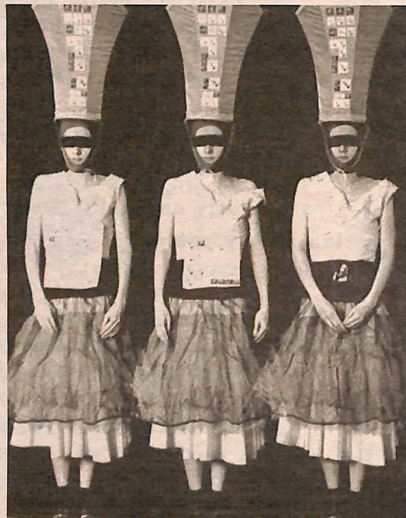
Janieta Eyre The Book of Small Souls , 1999 gelatine silver print