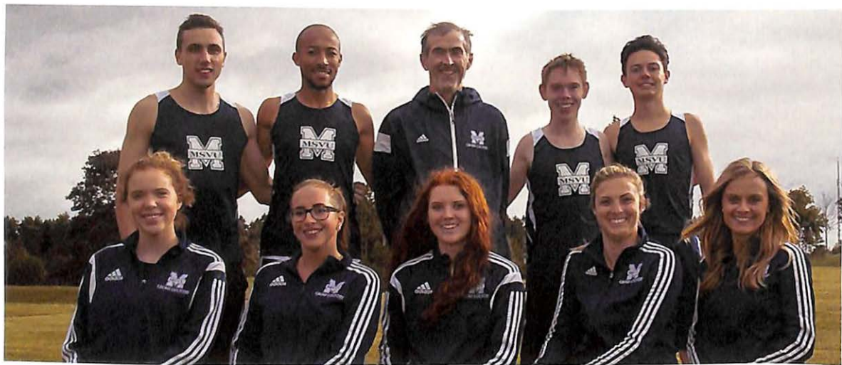
2017-18 Cross Country