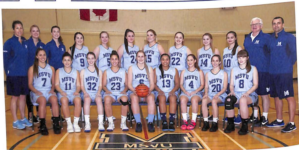
2017-18 Women's Basketball Team