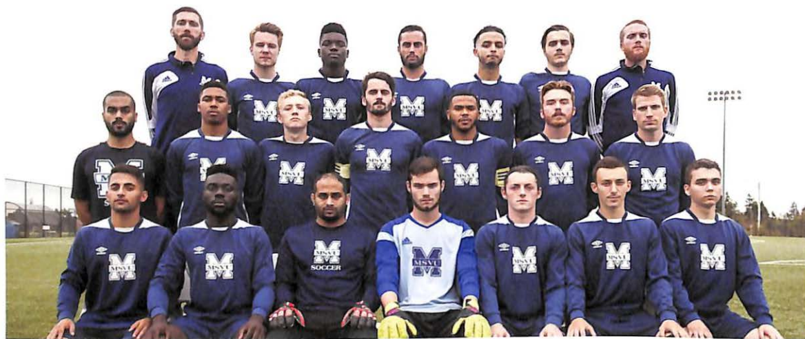
2017-18 Men's Soccer Team