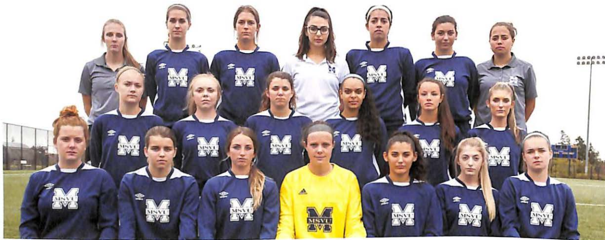
2017-18 Women's Soccer Team