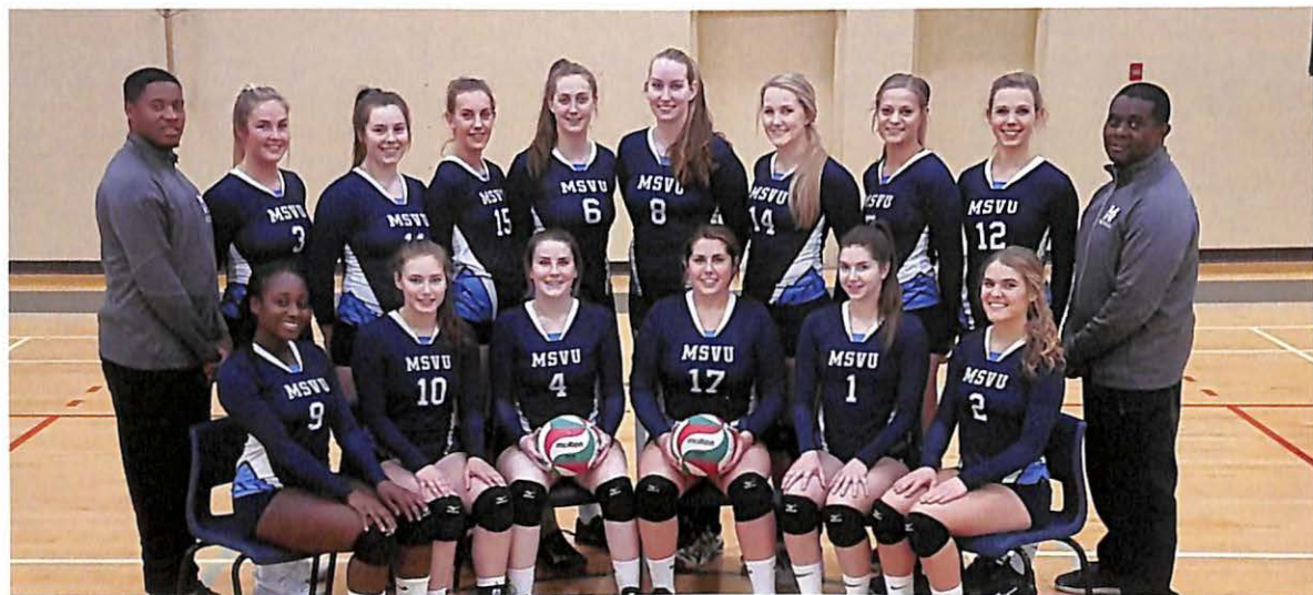
2017-18 Women's Volleyball Team