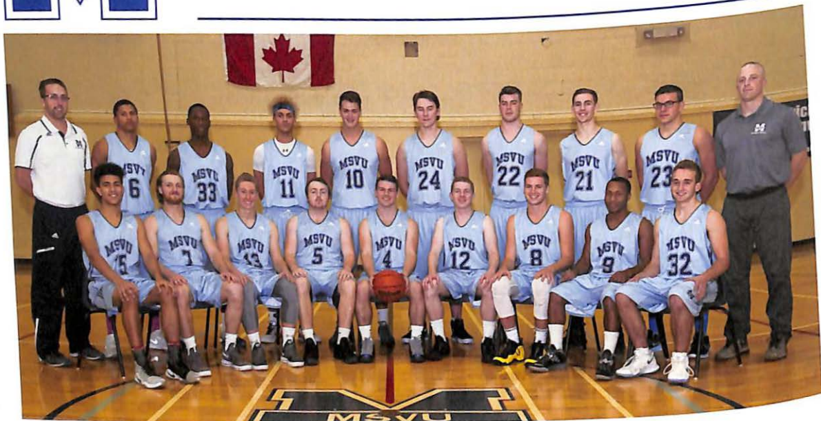
2017-18 Men's Basketball Team