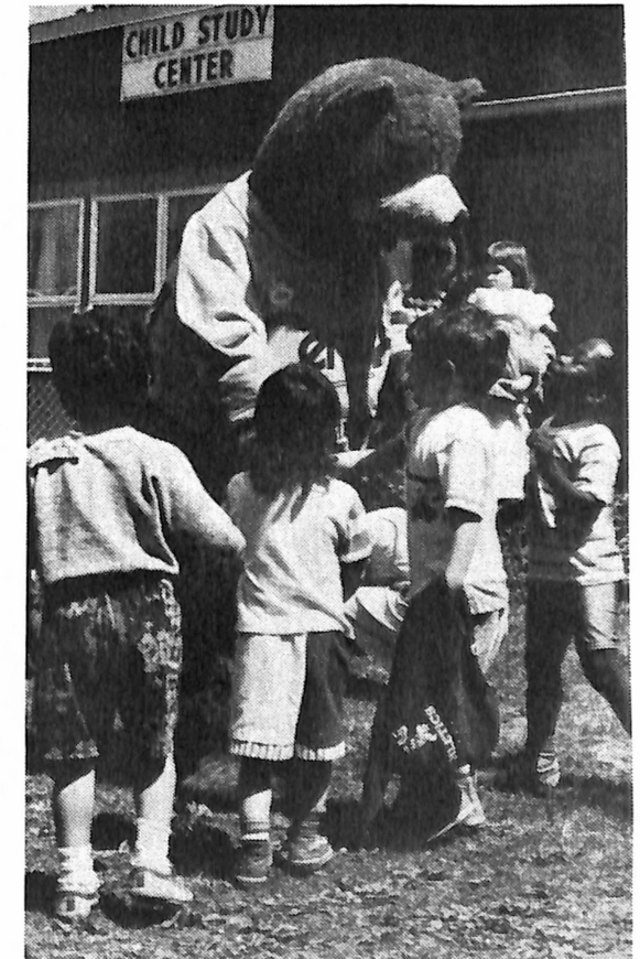
Little fans surround the huggable guest of honor at the Child Study Centre's recent annual Teddy Bears Picnic. Two hundred guests, including children attending the Centre, their parents and their sisters and brothers, were on hand to show off their favorite teddy bears over refreshments.

as philosopher Ivan Illich and sociologist Guy Rocher. This year's theme is Culture and Communications: challenge for the 90s. For more information contact the IOHE Secretariat, 2875 boulevard Laurier, Sainte-Foy, Québec G1V 2M3, tel: (418) 675-3551.