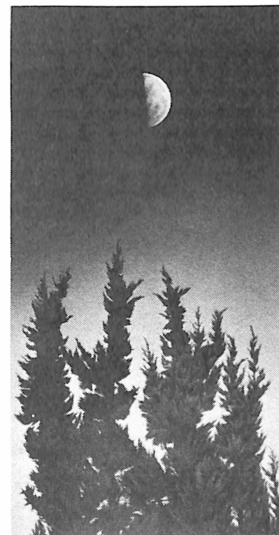
Cypress Moon , 1988, a 46 X 93 cm watercolour by Nova Scotia artist Suezan Aikins, from the Mount art gallery's permanent collection.

Nomination forms are available from: the offices of the Deans, Vice-President (Academic), alumnae and student council; the Seton front desk; and the Picaro office.